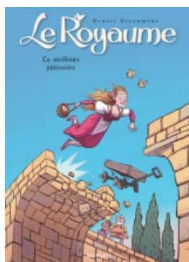
La meilleure pâtissière