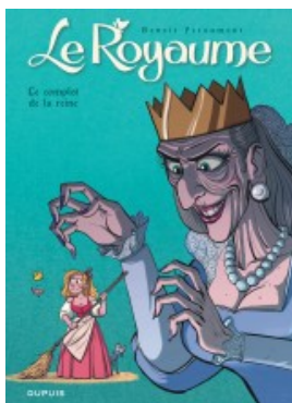
Le complot de la Reine T1/2