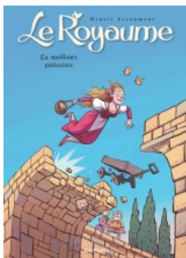
La meilleure pâtissière