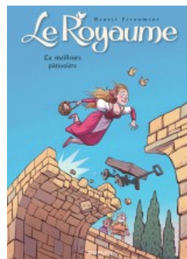
La meilleure pâtissière