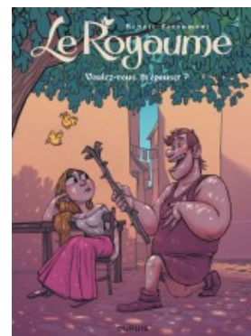
Voulez-vous m'épouser ?