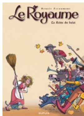
La Reine du balai