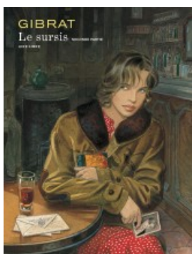
Le Sursis tome 2