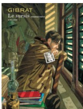
Le Sursis tome 1