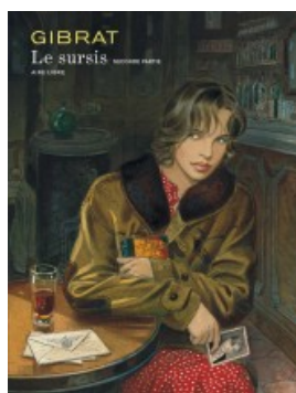
Le Sursis tome 2