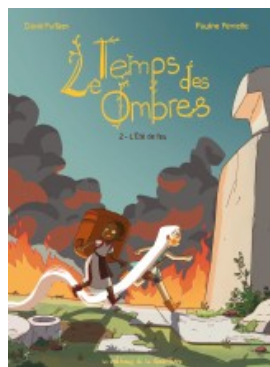
L'Été de feu