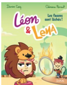
Les fauves sont lâchés