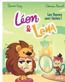
Les fauves sont lâchés