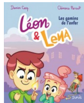
Les gamins de l'enfer