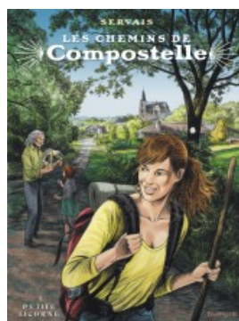
La petite licorne