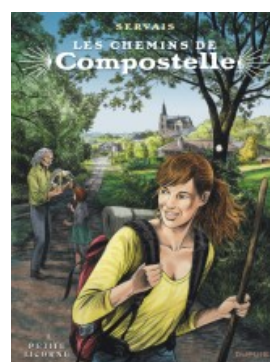
La petite licorne