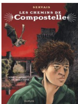
Le vampire de Bretagne