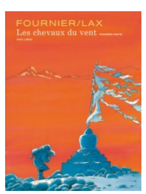
Les chevaux du vent tome 1