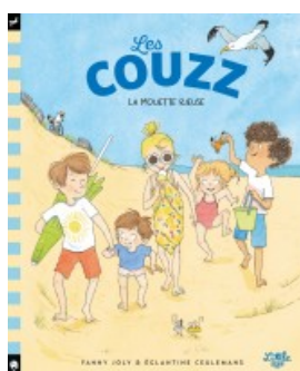
Les Couzz - La Mouette rieuse