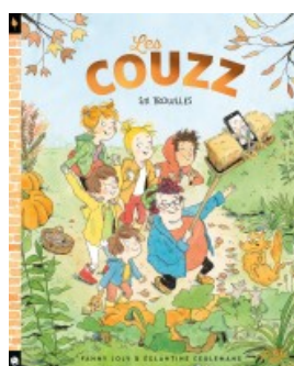
Les Couzz - Six trouilles