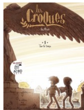
LES CROQUES T1 - TUER LE TEMPS