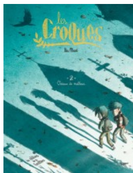
LES CROQUES T2- OISEAUX DE MALHEUR