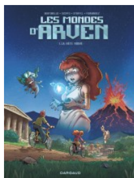
La Bête noire