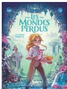
La danseuse d'Angkor Vat