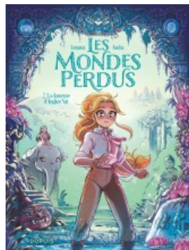
La danseuse d'Angkor Vat