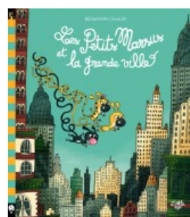
Les Petits Marsus et la grande ville