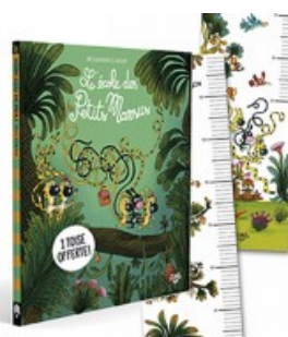
École des Petits Marsus