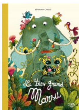
Le très grand Marsu