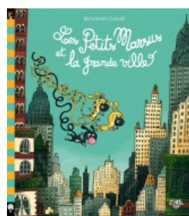
Les Petits Marsus et la grande ville