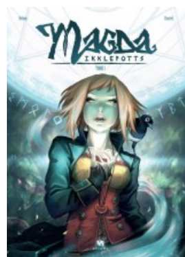
MAGDA IKKLEPOTTS T01