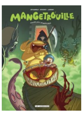
Grande peur et petit creux