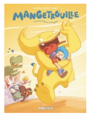
Frousses frissons et fringales