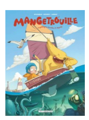
Coquillages chocottes et clapotis