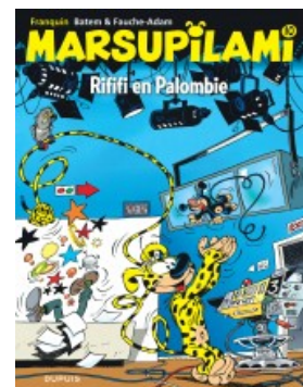
Rififi en Palombie