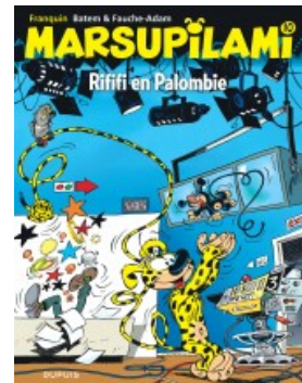
Riffi en Palombie