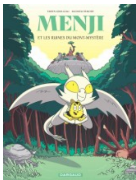
Menji et les ruines du Mont-Mystère