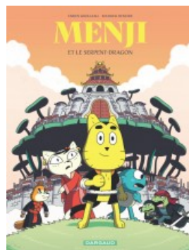
Menji - Tome 1