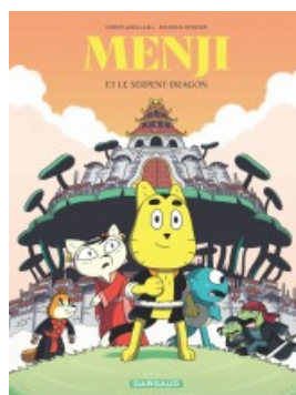
Menji - Tome 1