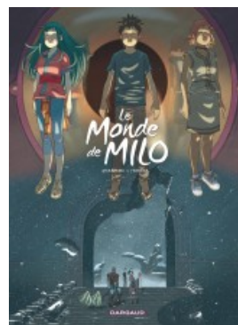
La Terre sans retour - tome 2