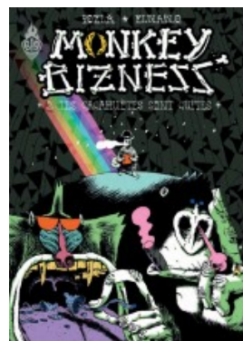
MONKEY BIZNESS 2 LES CACAHUETES SONT CUITES