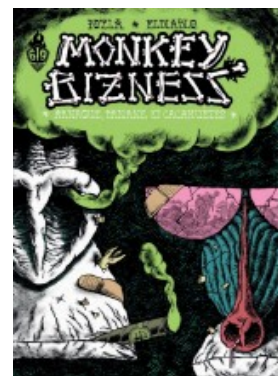
MONKEY BIZNESS 1 ARNAQUE BANANE ET CACAHUETES