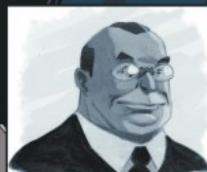
Lavrenti Pavlovitch BERIA 54 ans. Membre du Comité Central du Parti Communiste d'Union Soviétique, Ministre de l'Intérieur.