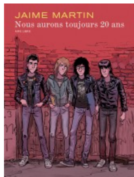
Nous aurons toujours 20 ans