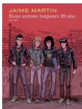
Nous aurons toujours 20 ans