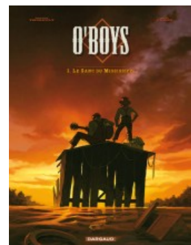
Le Sang du Mississippi