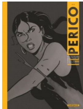
Perico - tome 2