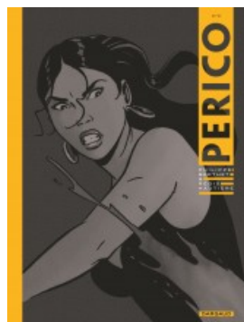
Perico - tome 2