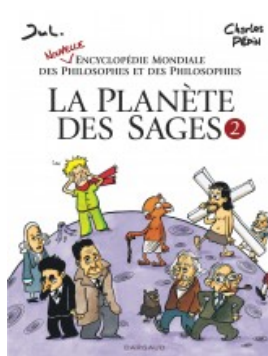
La Planète des sages - tome 2