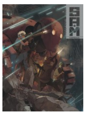
Un million d'hivers