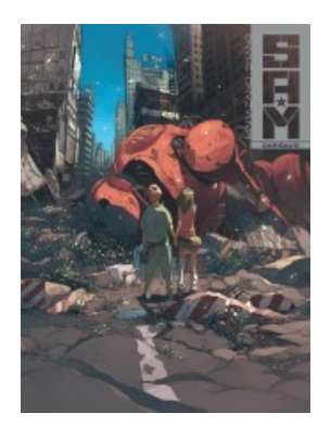
Nous ne t'oublierons jamais