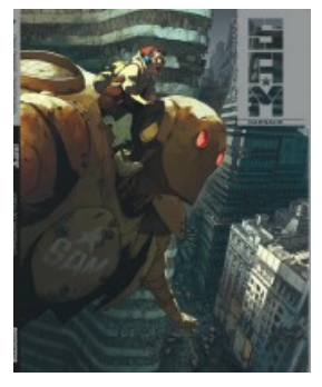
Chasseurs de robots