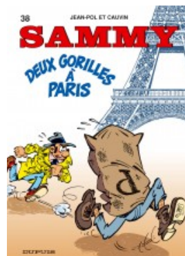
Deux gorilles à Paris