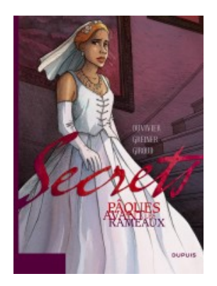
Secrets Pâques avant les Rameaux