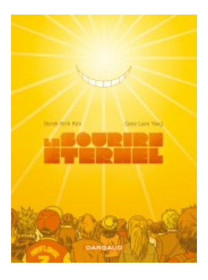
Le Sourire éternel