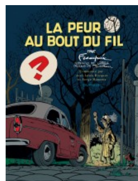
La peur au bout du fil