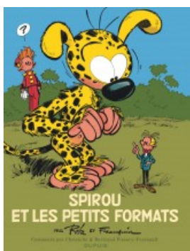
Spirou et les petits formats