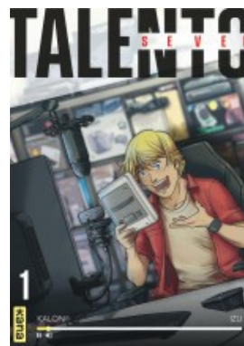
Talento Seven - tome 1