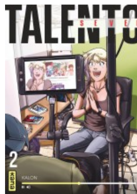
Talento Seven - tome 2