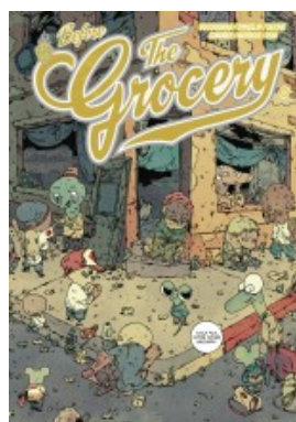
BEFORE THE GROCERY T0