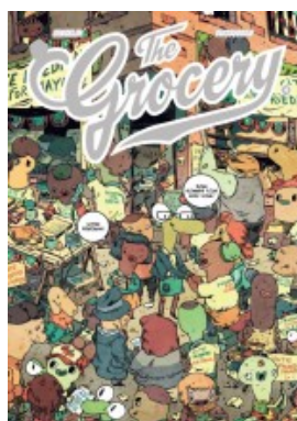
THE GROCERY T04