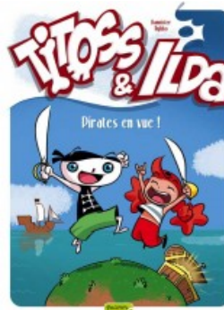
Pirates en vue !