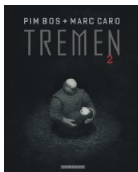
Tremen - tome 2