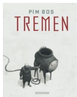
Tremen - tome 1