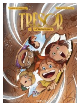
La vague rouge