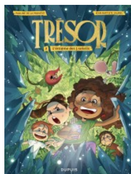
L'énigme des 3 soleils