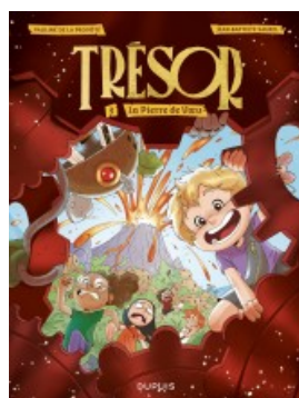
La Pierre de Voeu