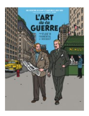
L'Art de la guerre