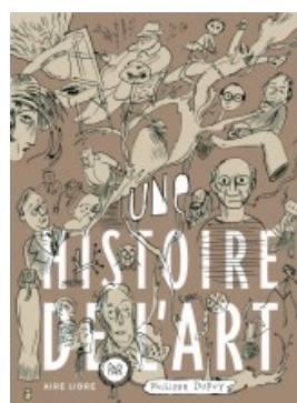
Une histoire de l'art