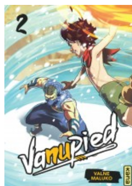
Vanupied - tome 2