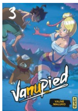
Vanupied - tome 3