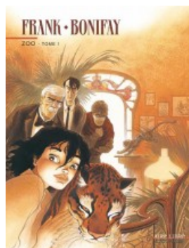
Zoo tome 1