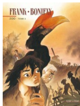
Zoo tome 3